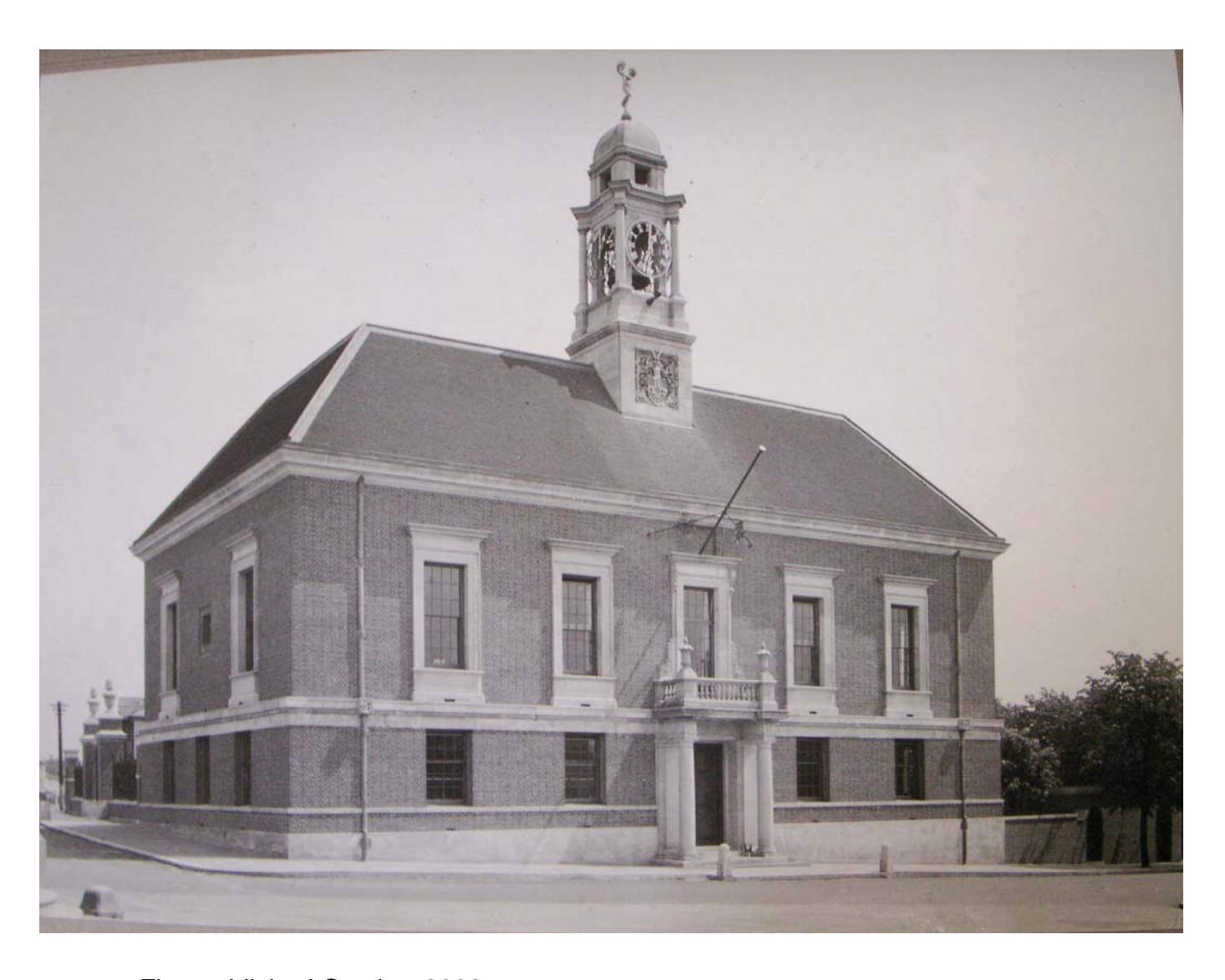
First published October 2008 By Braintree District Museum

A History and Description of Braintree Town Hall