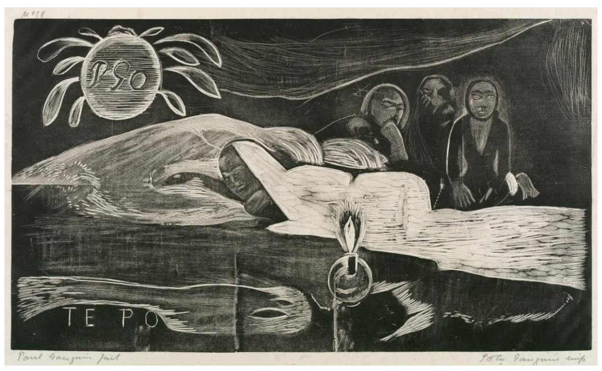
Paul Gauguin, Te Po (1893-94), © The Samuel Courtauld Trust, The Courtauld Gallery, London

woodblock prints, Noa Noa (1893-94), which depict the real people he met in Tahiti within the stories of Tahiti's version of the creation myth. Gauguin was very experimental in his approach, and made his woodblocks using the tools and objects he had to hand.