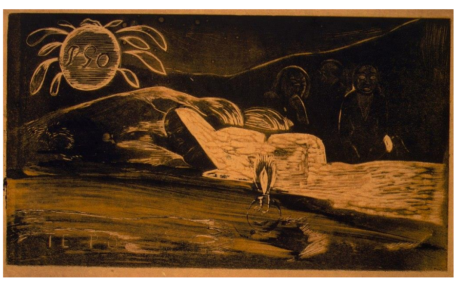
Paul Gauguin, Te Po (1893-94), The Metropolitan Museum of Art, New York

Once your prints are dry, try using paint or felt tips to add more colour to your works.